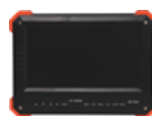
X41T Camera Tester