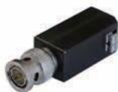
DS-1H18 Video Balun