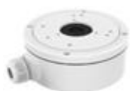
DS-1280ZJ-XS Junction Box