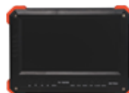
X41T Camera Tester