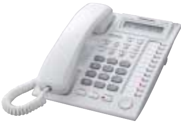
KX-T7730 LCD, Speakerphone Unit