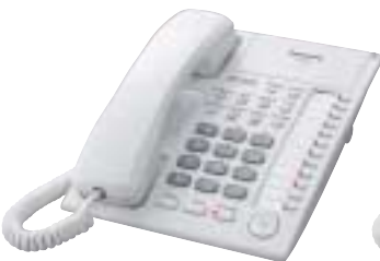
KX-T7720 Speakerphone Unit